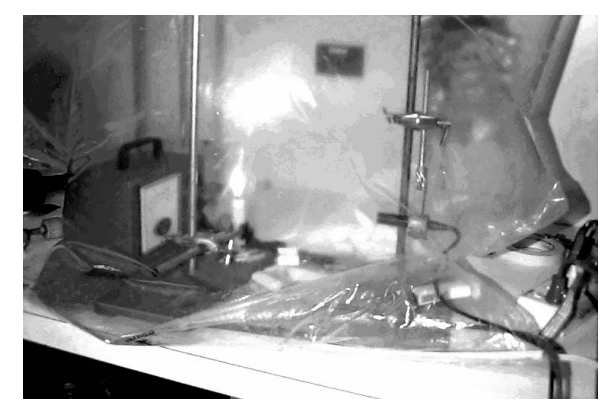
Plate 2. Close-up of experiment. Note, mini video camera centre right.