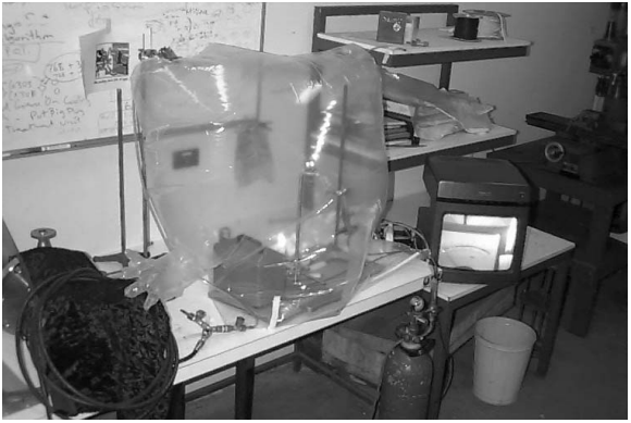
Plate 3. Overall view of experimental setup. Video recorder and argon gas bottle.